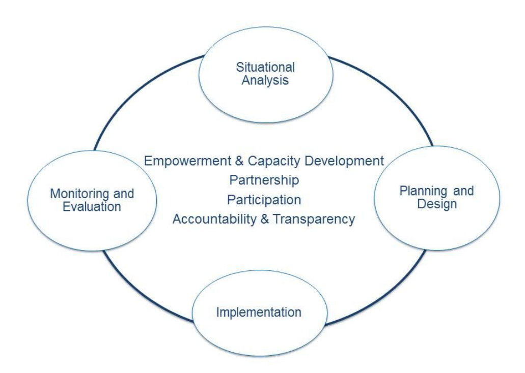
Figure 1: Programme cycle and the principles of a HRBA approach for NGOs

Application in programming means that the respective principles inform all stages of the programming process (situation analysis, design and planning, implementation and monitoring and evaluation) as displayed in figure 1. This approach is similarly outlined in several handbooks and checklists for national human rights institutions [7] [5] [8] as well as for other actors in the field of health and development [9] [10] [1] [11].